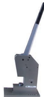
Table press with interchangeable inserts